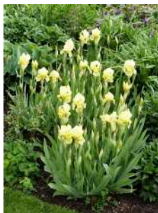
Iris 'Ola Kala'

I think Irises are only successful in a larger garden - in a small garden their fleeting flowers are not a good use of limited space where every plant has to earn its keep - but we still grow a number of them. One of the best performers is Iris 'Ola Kala', a golden yellow, which in most years has a second flush of flowers later in the year. Ola Kala is apparently a Greek expression for 'all is well' and is reputed to be the source of OK as a confirmation. Two other Iris we particularly enjoy are 'Jane Phillips' and 'Roulette'.