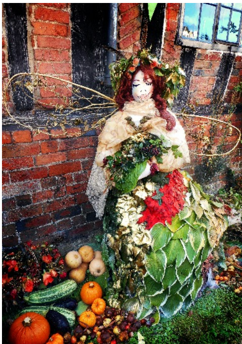
2016's winning scarecrow.