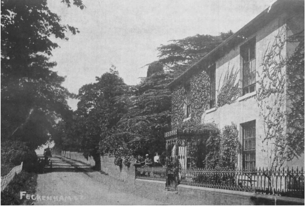
Brook House from an old postcard showing not only an extremely well dressed couple from the early twentieth century, but also the quiet rural lane that was the B4090! The photograph shows off the lovely iron work on the porch and the grand old trees in the garden.