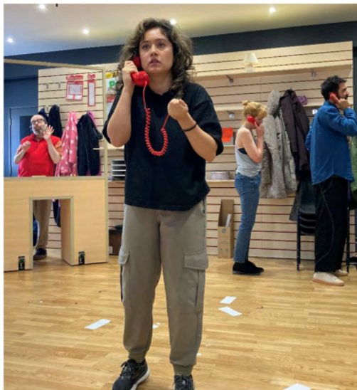
The cast of "Make Good" in rehearsal.