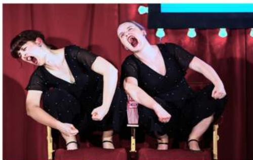
Desert Island Flicks

Book online through www.feckhall.org Book by phone on 0333 666 3366