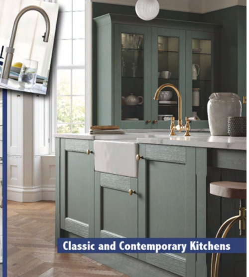
Classic and Contemporary Kitchens