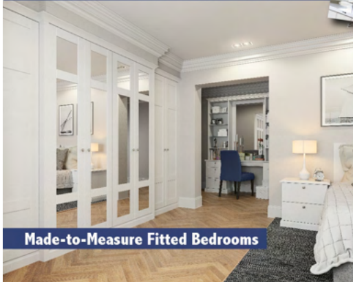
Made-to-Measure Fitted Bedrooms