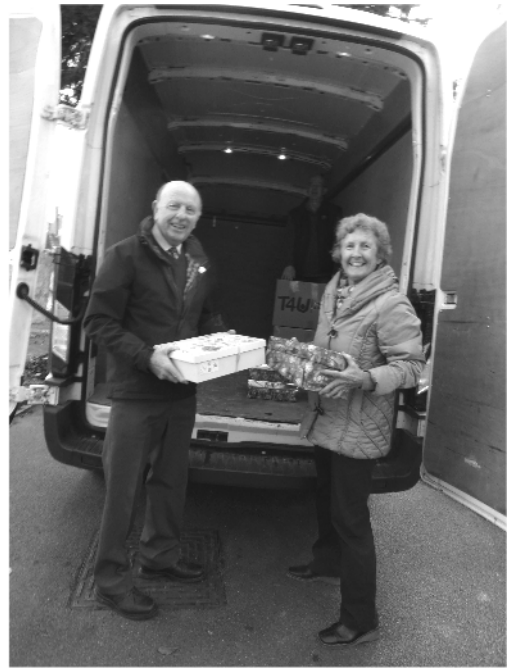
Help getting boxes on stage one of their journey.

I would also like to thank the children from Feckenham First School for their continued support, thank you also for all your very kind donations, and thank you to our fantastic knitters too.