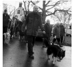
Setting out from The Square

There'll be another walk next Boxing Day - why not give it a try? It gets you out of the house, freshens you for the remainder of the festivities - and can be used to tire out the kids/dogs or visiting relatives.