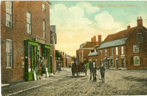
A postcard of the High Street next to the Square (posted by Jay Neale)

There has also been a fascinating stream of old photos and postcards of the village, making all of us imagine what life was like back then. The people in some of the photos have even been identified!