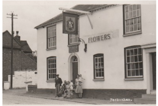
The Lygon will soon open its doors for takeaway only, having restored the pub and its former name. (Posted by Jay Neale)