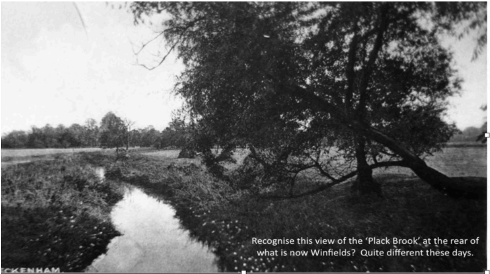
Recognise this view of the 'Plack Brook' at the rear of what is now Winfields? Quite different these days.