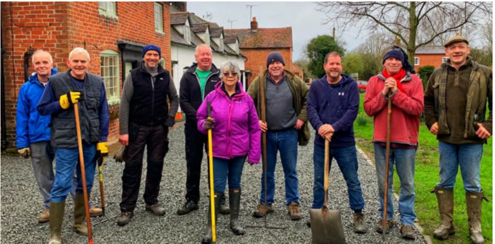
The Gravel Crew

The Square Committee's annual Fun on the Square event was planned for 18th July and would have been themed around "Dad's Army"... If it does take place it'll be a very much simpler event - watch this space!